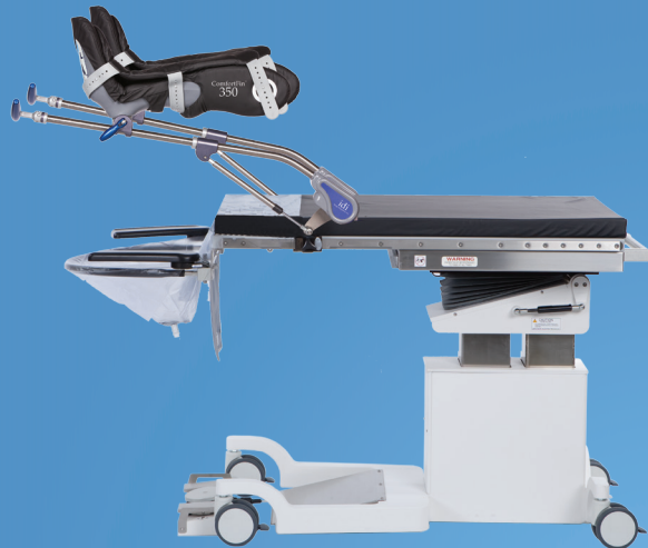
IDI's Aspect 100UCPlus The industry's best-selling urology table A100-1517