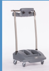
ComfortFin Storage Cart C100-3044