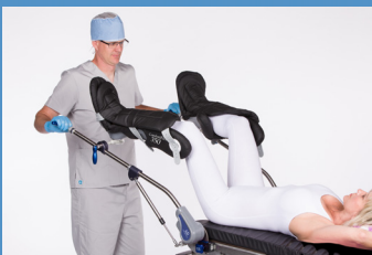
ComfortFin 350 or 500 Stirrups A100-2246 or A100-2247