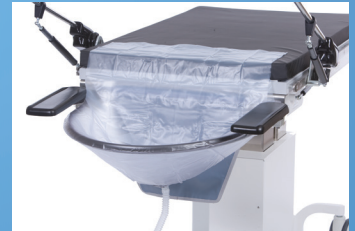
Drain Bags Case of 20 C000-0593

Order package A100-2521 for the Aspect 100UCPlus package with ComfortFin 350 Stirrups Order package A100-3107 for the Aspect 100UCPlus package with ComfortFin 500 Stirrups