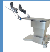
ComfortFin 350 stirrups shown on IDI Urology table